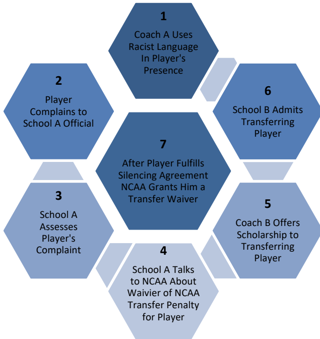
Table 1A Hypothetical Conspiracy Between NCAA and School: Silencing Complaints of Racist Treatment of Player